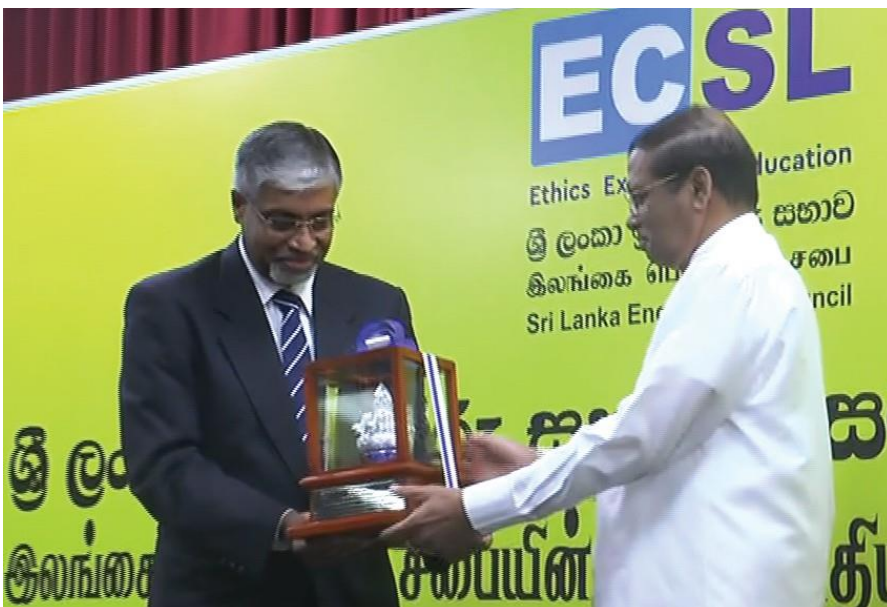
Handing over souvenir to the His Excellency