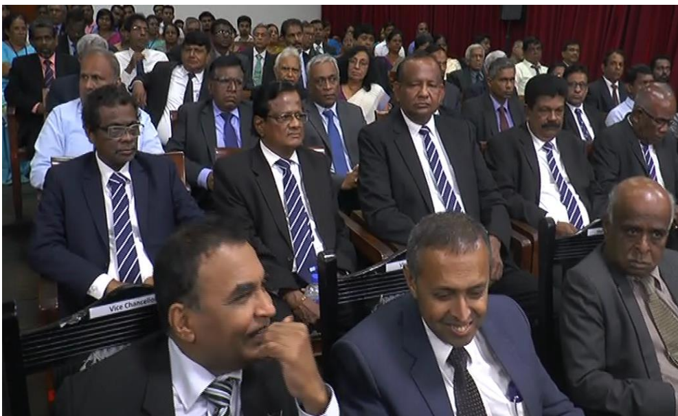
Invitees and Council Members