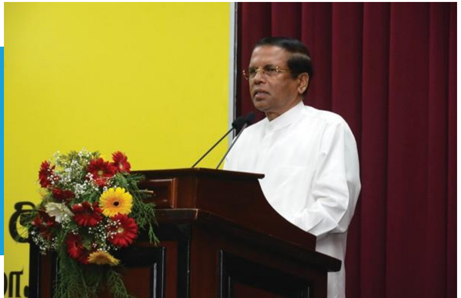
Address by the His Excellency the President