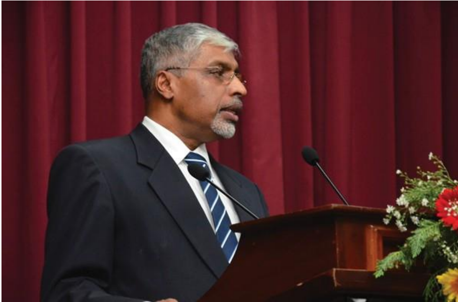
Address by the Chairman ECSL