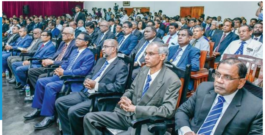
Invitees and Council Members