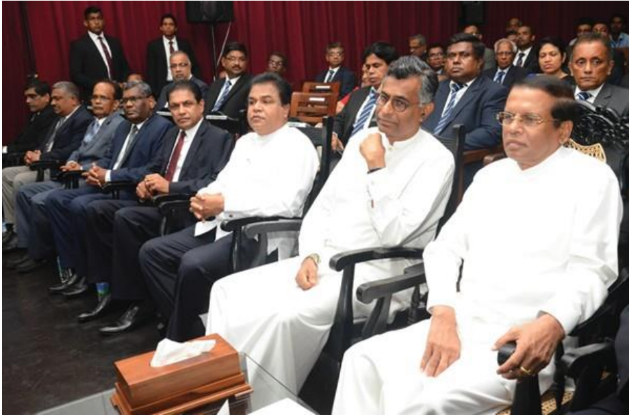
Invitees and Council Members