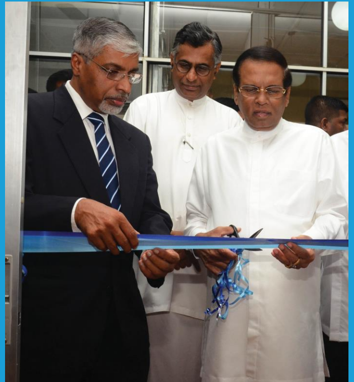
ECSL Office opening